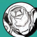
IRON MAN TONY STARK A.I.