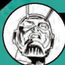
ANT-MAN SCOTT LANG