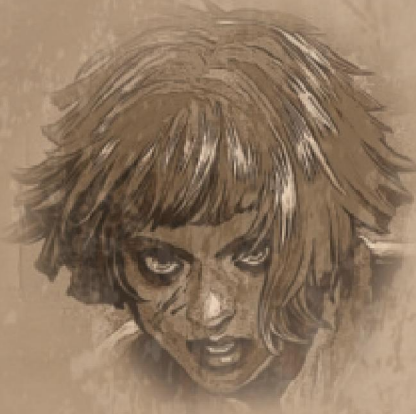
illustration of latest appearance: