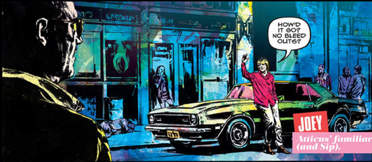
JOEY Atticus' familiar (and Sip).