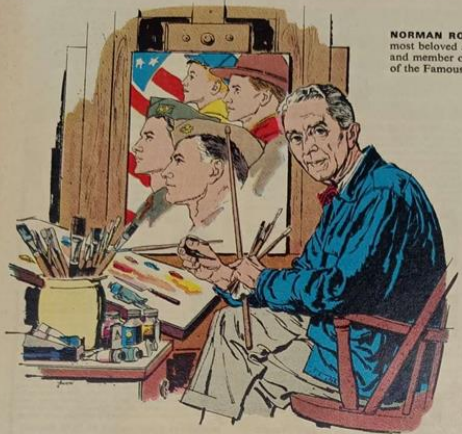
NORMAN ROCKWELL—America's most beloved artist. He is a founder and member of the Guiding Faculty of the Famous Artists Schools.

"We're looking for people who like to draw" says NORMAN ROCKWELL