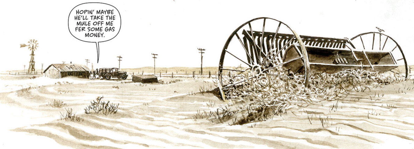
FIGURE WE'LL GIT THAT FAR BY NIGHTFALL.

HOPIN' MAYBE HE'LL TAKE THE MULE OFF ME FER SOME GAS MONEY.